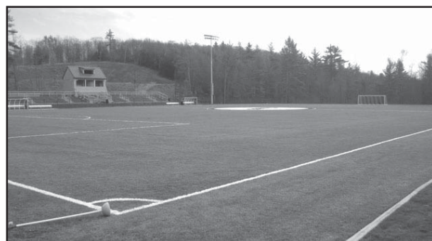
Sodexo Field in the summertime.