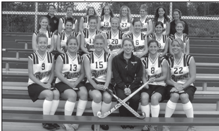
2006 Franklin Pierce field hockey team.