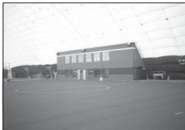
Indoor location for Field Hockey Camp

A professional, athletic trainer is available at all times. Parents' personal insurance should cover all external emergency care.