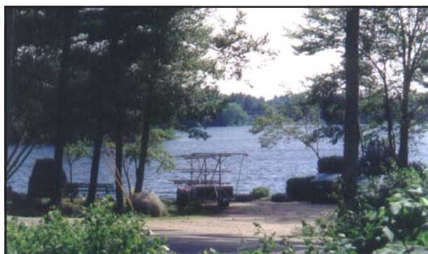
Pearly Pond across the street from Sodexo Field

Camp instruction and games will take place in the multi-million dollar, state-of-the art Grimshaw-Gudewicz Activity Center, the Franklin Pierce Fieldhouse and Sodexo Field.